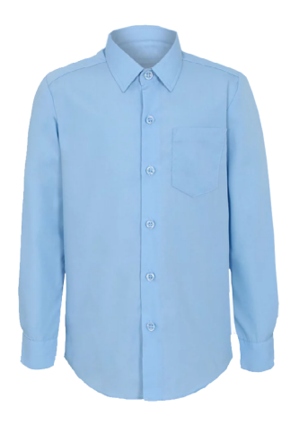
Light blue shirt (white for Years 10 & 11)

All other garments below can be purchased from any retailer provided they are in line with the descriptions below.