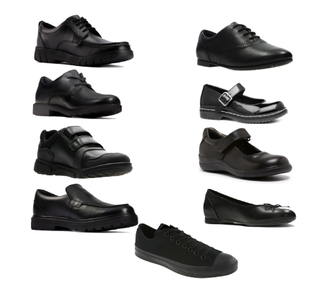
Plain black shoes (if laced must be black laces, no logos or markings)