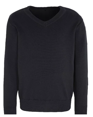
Navy blue v-neck jumper optional