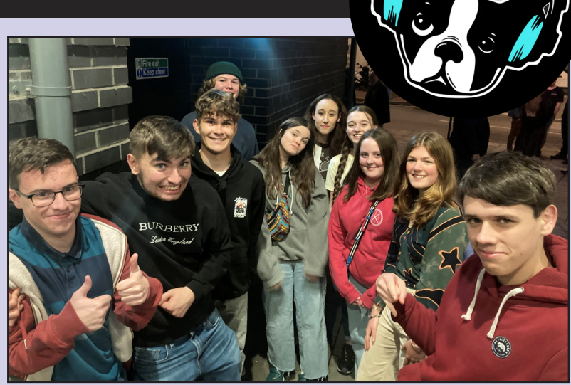
Excited music students about to see Snarky Puppy