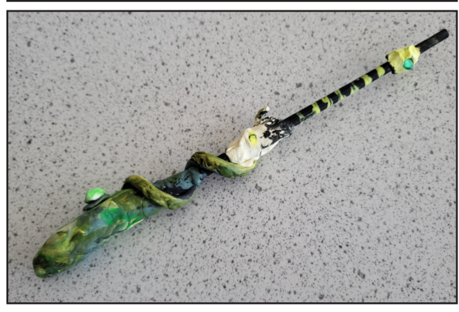
Every Wednesday -Science Lab 2